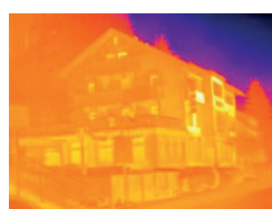
Thermal image without ScaleAssist

Since the temperature scale and colouring of thermal images can be adapted individually, it is possible that the thermal behaviour of a building, for example, can be wrongly interpreted. The testo ScaleAssist function solves this problem by adjusting the colour distribution of the scale to the interior and exterior temperature of the measurement object and the difference between them. This ensures objectively comparable and error-free thermal images.